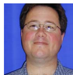
Bruce Beddow B2E Consulting Engineers